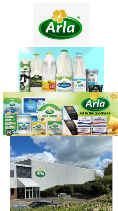
Arla Packaging Facility, Maesbury Road Industrial Estate, Oswestry