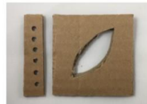
Hole (Cut or Punched)