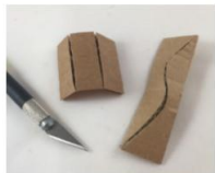
Score & Bend